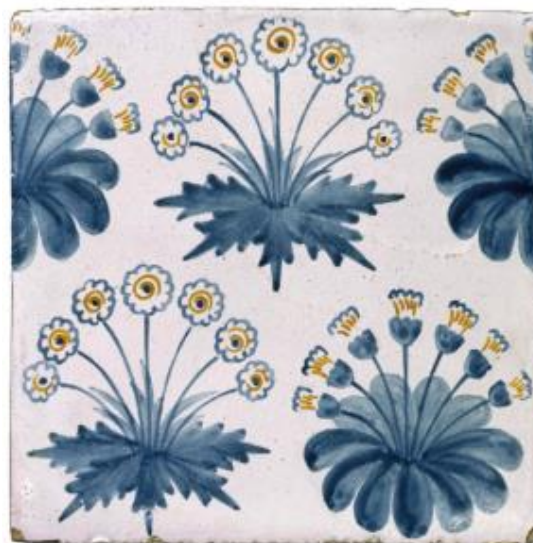
William Morris created designs of floral patterns that could be repeated many times

In 1896, Morris died at the age of 65. At the time of his death doctors remarked that he had carried out the work of 10 men in his lifetime, which contributed to his death.