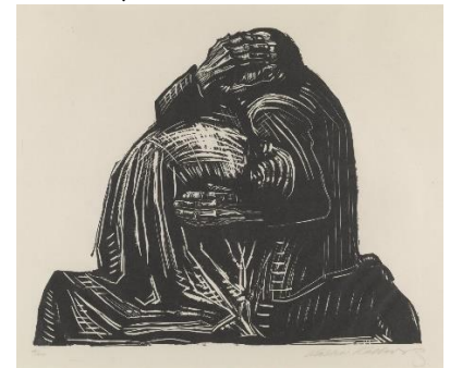
The Parents – 1921 - 22