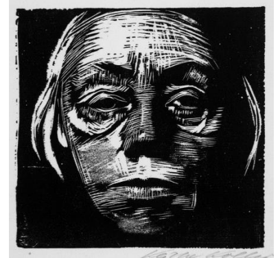
Self-portrait – 1922-23