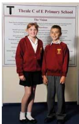
Winter School Uniform