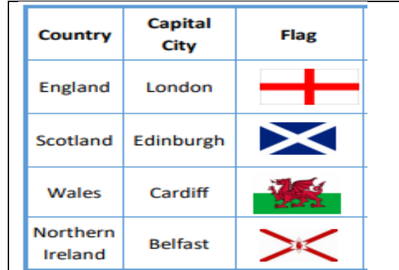
Capital cities and their flags