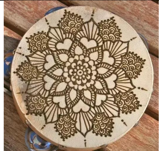
An example of a mandala