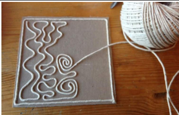
A string print design.