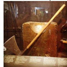
Tudor execution block and axe