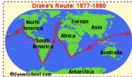
Sir Francis Drake's route around the world