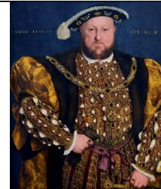
Portrait of Henry VIII