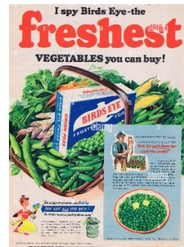
1960s frozen peas advert