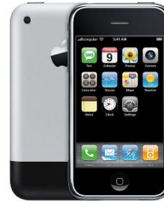
First iPhone (2007)