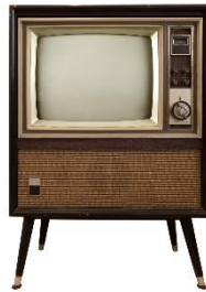
1960s television set