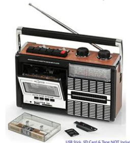
1980s cassette player