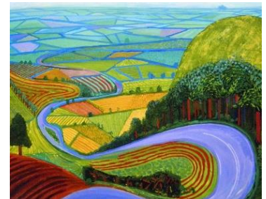
David Hockney – Garrowby Hill 1998

Joseph Mallord William was born in London in 1775. His dad was a barber, but Turner always knew he wanted to be an artist. When he was just 14 years old he became a student at the Royal Academy of Art in London.