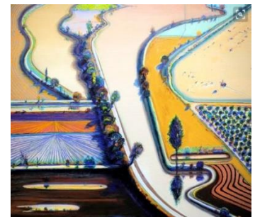
Wayne Thiebaud – Levee Farms, 1988