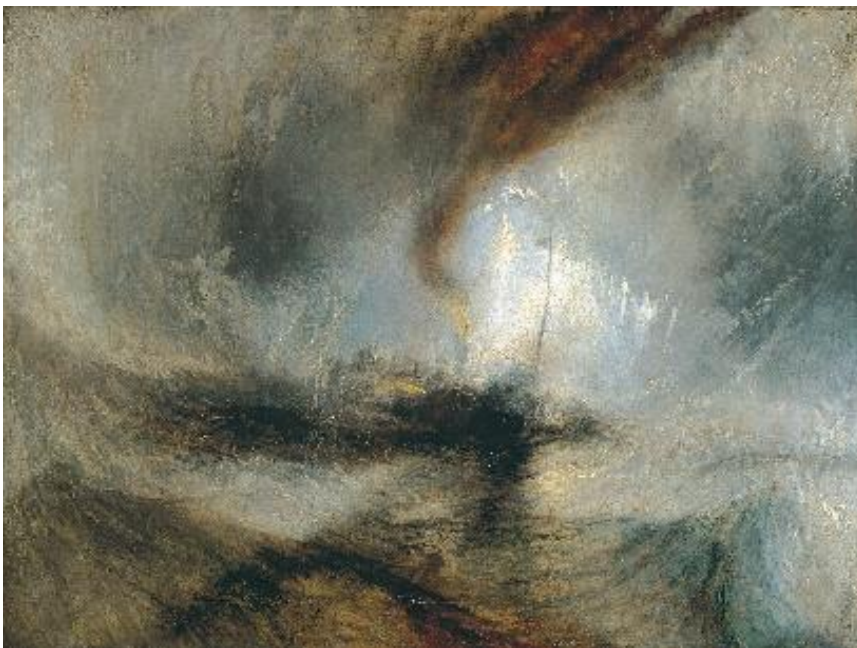
William Turner – Storm at Sea, 1842