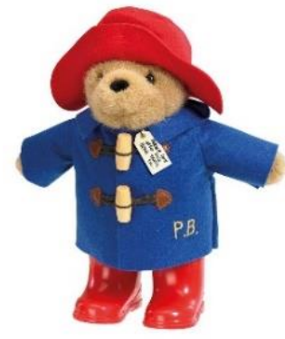
Snakes and Ladders – 13th C Jigsaw Puzzle – 1767 Lego – 1932 Kermit the Frog – 1955 Paddington Bear – 1958