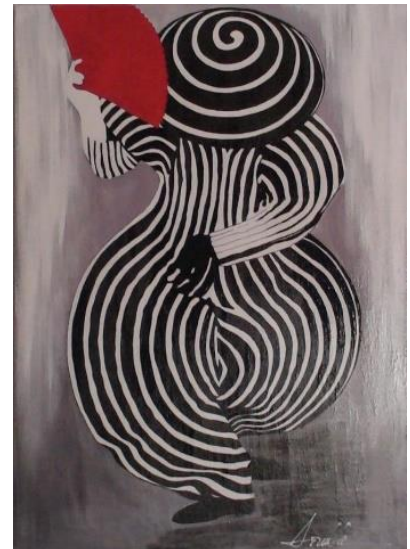
Oskar Schlemmer, a Bauhaus painter, sculptor and teacher created the Triadic Ballet in 1922.