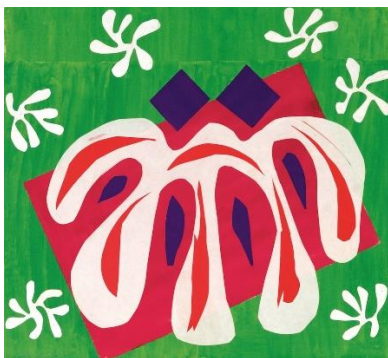
Henri Matisse – Paper Cuts, 1947